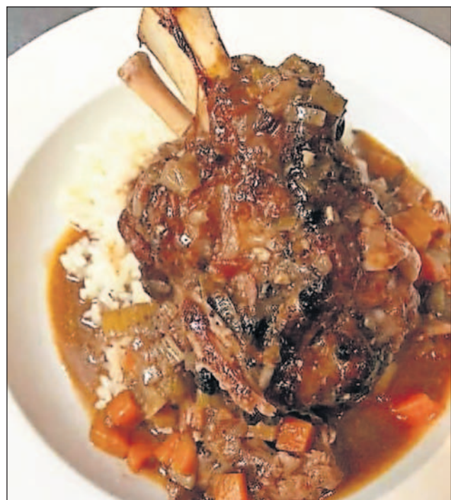
Vinny's Pizza & Pasta is known for its fresh, tasty Italian dishes.